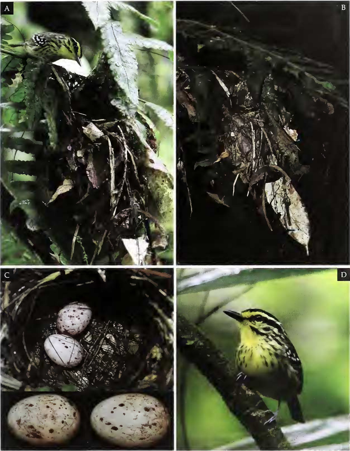
Figure 3. Yellow-browed Antbird Hypocnemis hypoxantha in eastern Ecuador. A: adult perched on rim of nest; B: in-situ photo of nest showing resemblance to naturally collected material; C: nest lining and eggs; D: adult (H. F. Greeney)